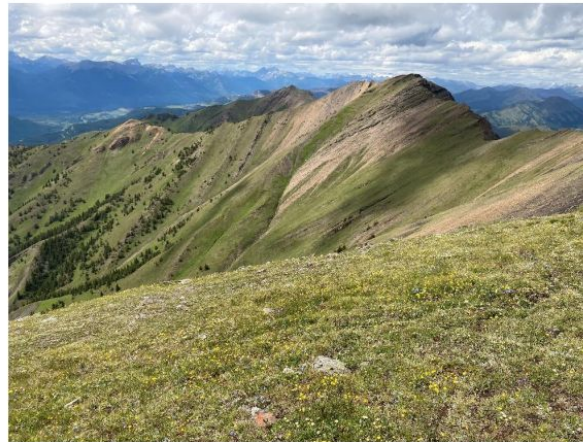
Photo 1 (top): High elevation grasslands on Turnbull Mountain facing Fording River Operations